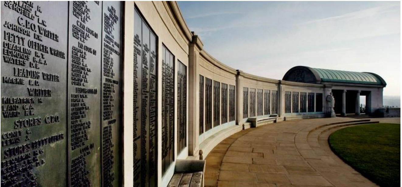
Chatham Naval Memorial