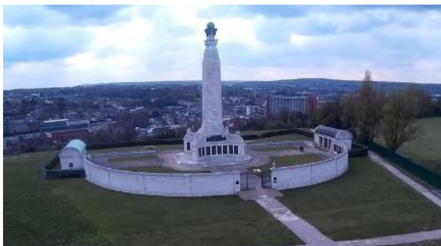
Chatham Naval Memorial

The Chatham Naval Memorial was unveiled by The Prince of Wales, the future Edward VIII, on 26 April 1924.