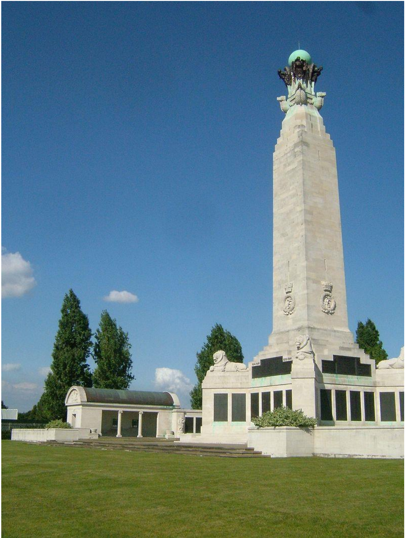
Chatham Naval Memorial